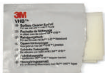
CL-W01 x 1